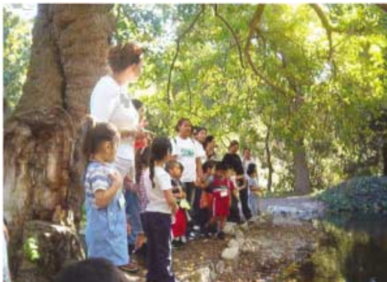
Head Start children from Center for Community Family Services – Head Start, Altadena, Ca learn and discover in Descanso Gardens, La Canada-Flintridge

MISSION STATEMENT The California Head Start Association is the unified voice providing leadership and advocacy for the Head Start community.