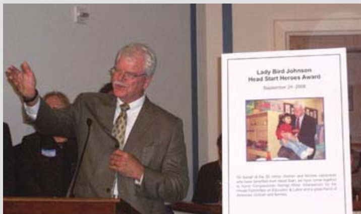
Rep George Miller accepting his award and reflecting on the challenges to come in 2009