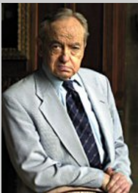
January 27, 2009