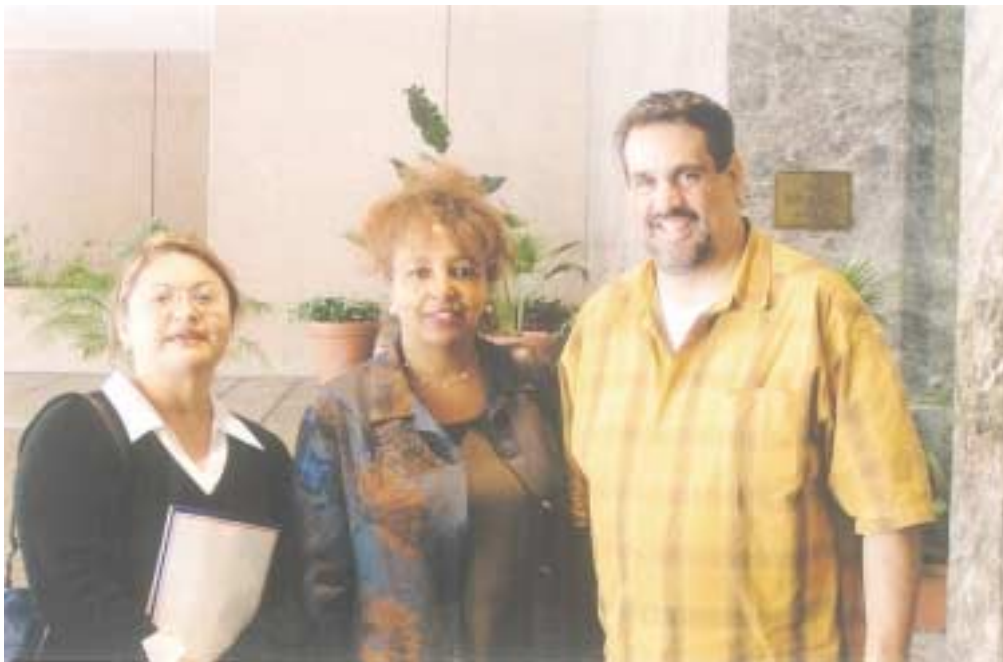
CHSA Leaders Meet in Washington D.C. to Educate Congress.