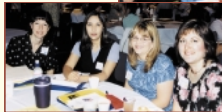
Cluster 6 - Central Valley Head Start staff attend Spring training on Initiatives.

Scan your community/family resources; assess community/family demands; engineer partnerships/collaborations; and craft plans of operation. Envision the best possible strategies that will link these initiatives and build successful outcomes for children and families. Again, be intentional and deliberate in your efforts!