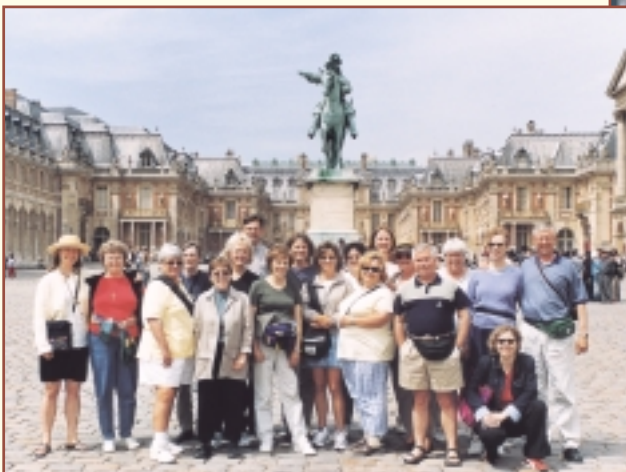
The full tour group makes a stop at the Palace of Versailles.

Watch for details...rumor has it that a 2004 Italy trip is being organized. "The well-filled life is long" Leonardo da Vinci