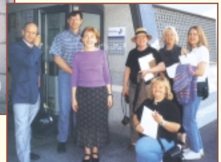
CHSA's France Tour visit a modern Ecole Maternelle Publique in Paris, France. School officials offer ideas and resources in the care and education of children ages 3 to 5.